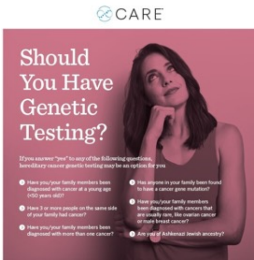
Figure 1. An example of supplemental material available for marketing and web use.

Ambry is encouraged by Lake Medical Imaging's results, as they reflect similar trends from other CARE Program partners on a national scale.