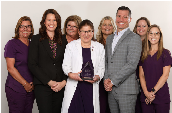
2022 RAD Honors Innovation Award from the Radiology Business Management Association.

This white paper highlights how the CARE Program can make it easier for medical practices to provide their patients proactive cancer screenings, genetic risk assessments, genetic testing and access to genetic counseling.